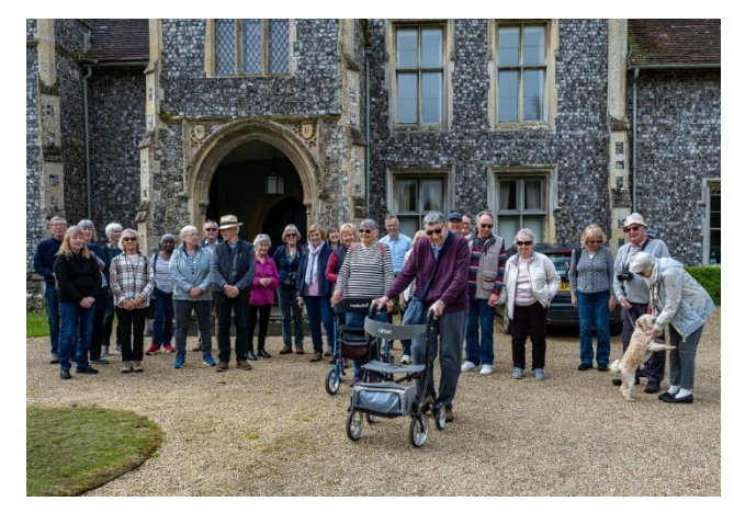
The Group at Elsing Hall

Our trips this year have included private visits to Elsing Hall and High View House, Roughton. In May we visited Elsing Hall which has 10 acres of beautifully maintained gardens, including a terraced garden overlooking the moat, which surrounds the manor house.